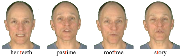
Fig. 1: A selection of movie frames during the articulation of /t/ illustrating the variability of articulator poses due to coarticulation.

visual speech independently of the underlying phoneme labels. Given some training video containing speech, the visible articulators are tracked and parameterized into a low-dimensional space. This parameterization is then automatically segmented by identifying salient points to give a series of short, non-overlapping gestures. These salient points are visually intuitive and fall at locations where the articulators change direction, for example as the lips close during a bilabial, or the peak of the lip opening during a vowel. The speech gestures identified by this segmentation are then clustered to form dynamic viseme groups, such that movements that look very similar appear in the same class. Identifying visual speech units in this way is beneficial as the set of dynamic visemes describes all of the ways in which the visible articulators move during speech. For the remainder of this paper visemes refers to dynamic visemes as defined in [17].